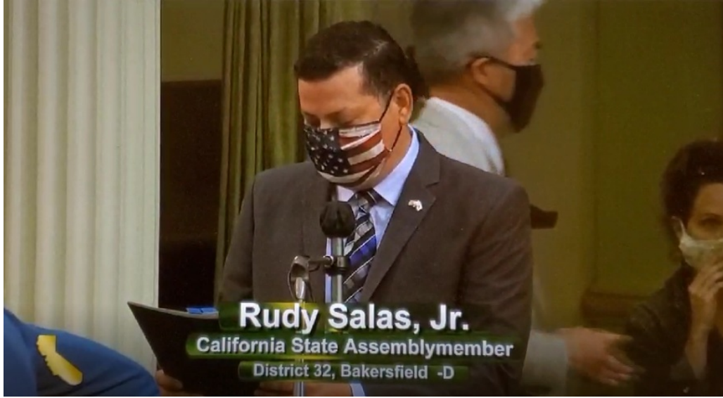
Assemblyman Rudy Salas, D-Bakersfield, presents SB393 on the Assembly Floor.