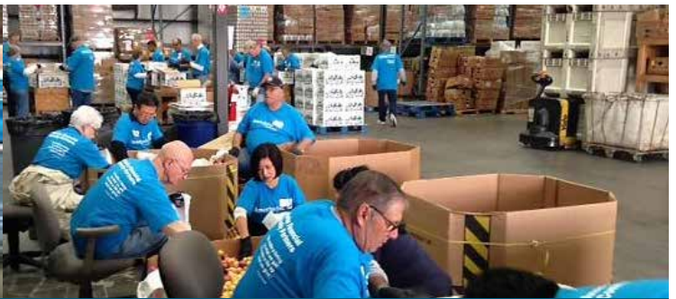
In November, Ameriprise Financial collected over 700 lbs. of food, which it donated to the Food Bank along with much needed cash. On Nov. 21, they brought 40 volunteers to help sort through the Holiday Food Drive donations.