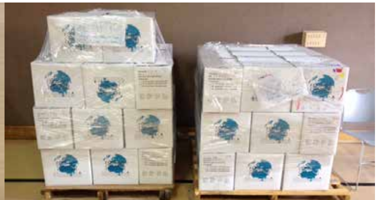
Feeding Children Everywhere packaged and donated nearly 80,000 lentil casserole packages. The donations will help feed the homeless and will also be distributed to food insecure children through the CAPK Food Bank's BackPack Buddies Program .