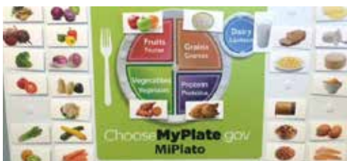
Beginning this year, the CAPK Food Bank's Produce Education Program (PEP) will provide important nutritional awareness to clients at four busy distribution sites monthly by focusing on the health benefits of consuming fresh produce. Interactive lessons and recipe cards will be a part of the healthy-eating fun.