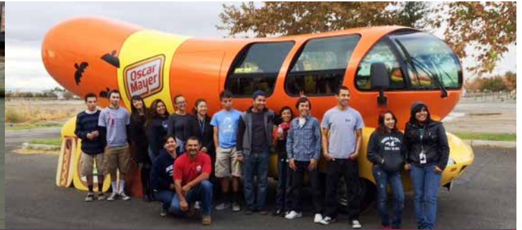
The Oscar Mayer Weinermobile donated 50 packages of hot dogs to the Food Bank on Volunteer Day, Nov. 1, 2014. Thanks to the 40 volunteers who assisted us that day: CSUB dancers and cheerleaders, and the Kai Big An Club.